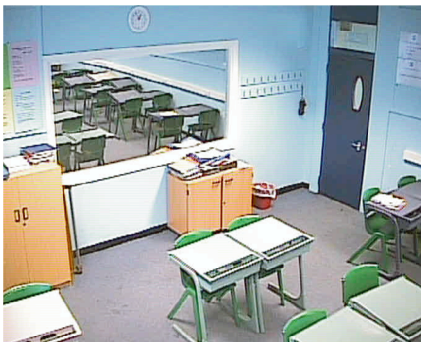
Typical views from Camera A