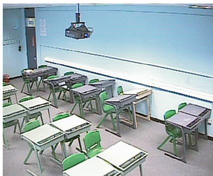
View from Camera B