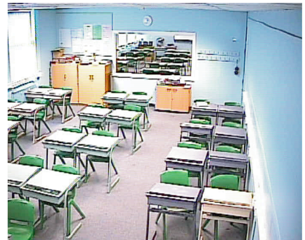
View from Camera C